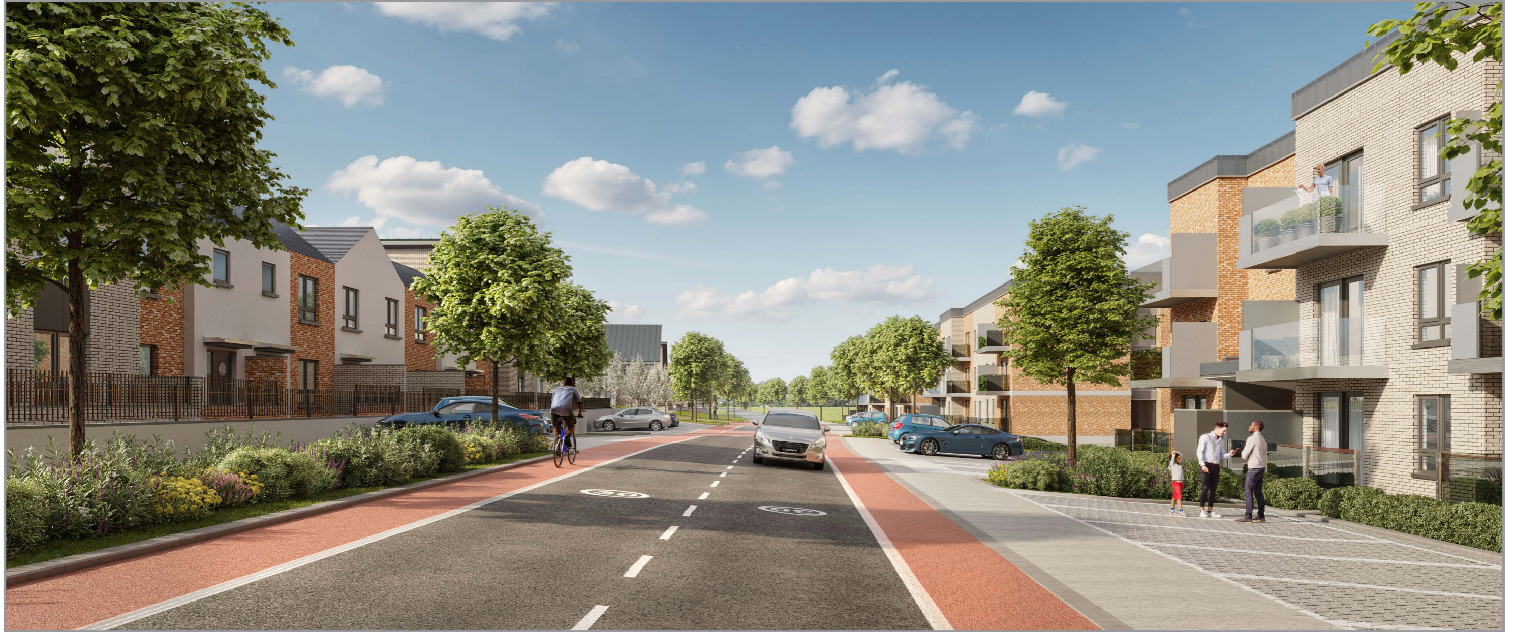
Location CGI 3