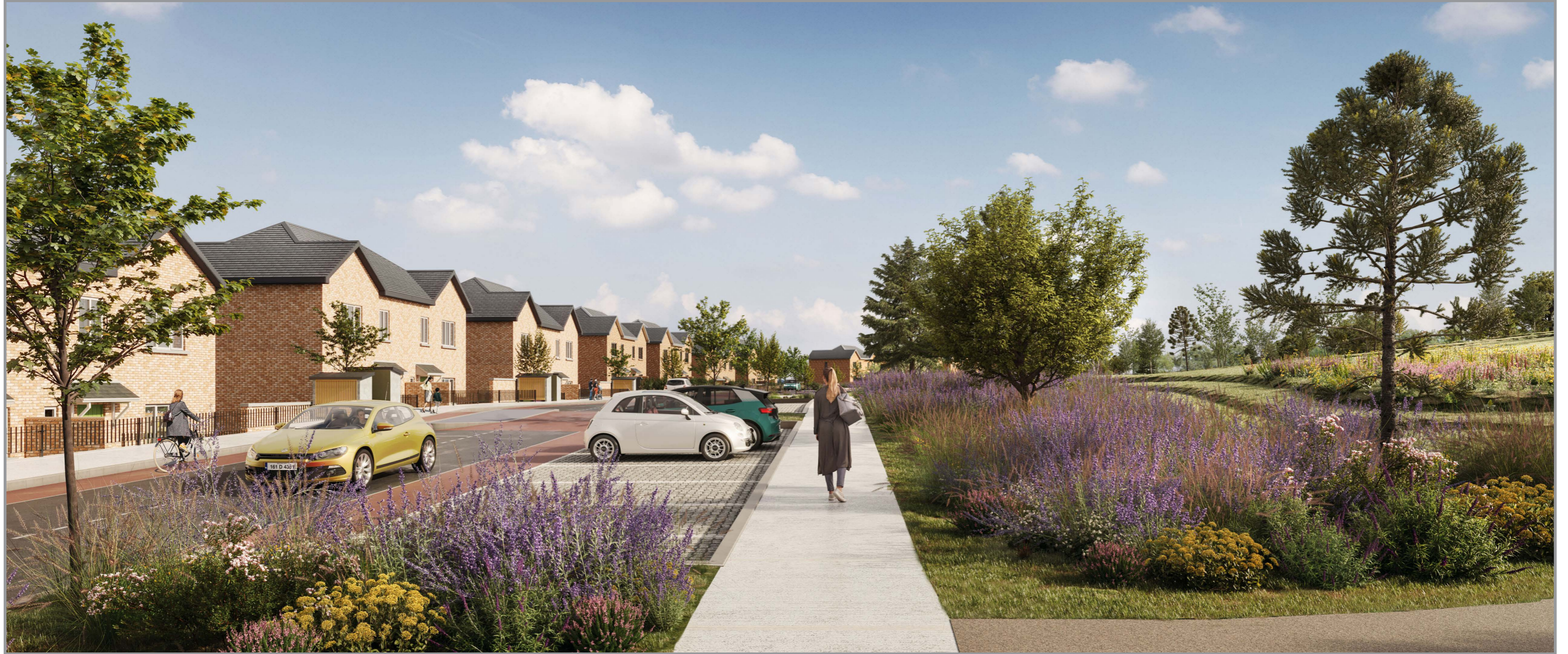
Location CGI 5