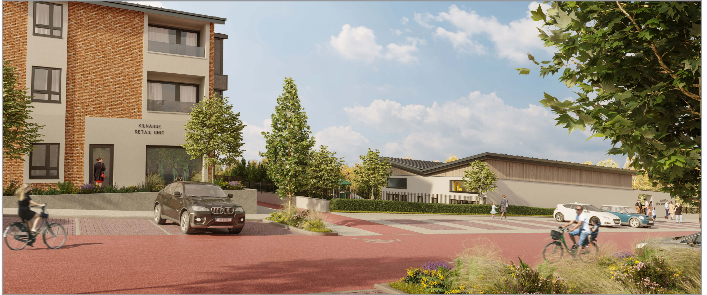
Location CGI 8