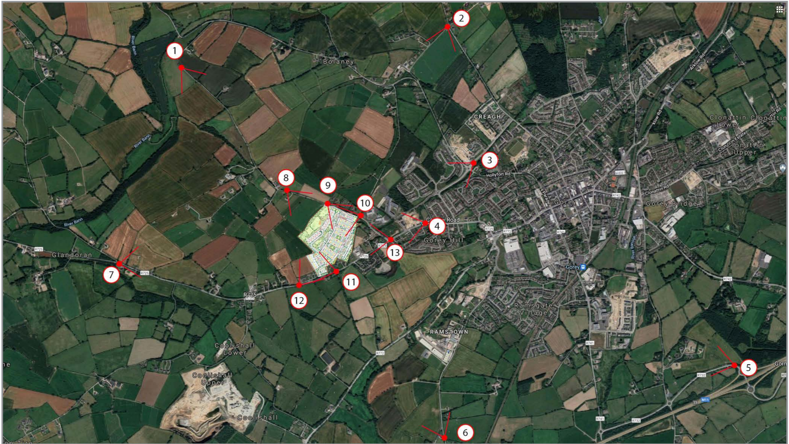
View Location Map

This map is for view location purposes only. Please refer to Architects drawings for site layout and redline boundary.