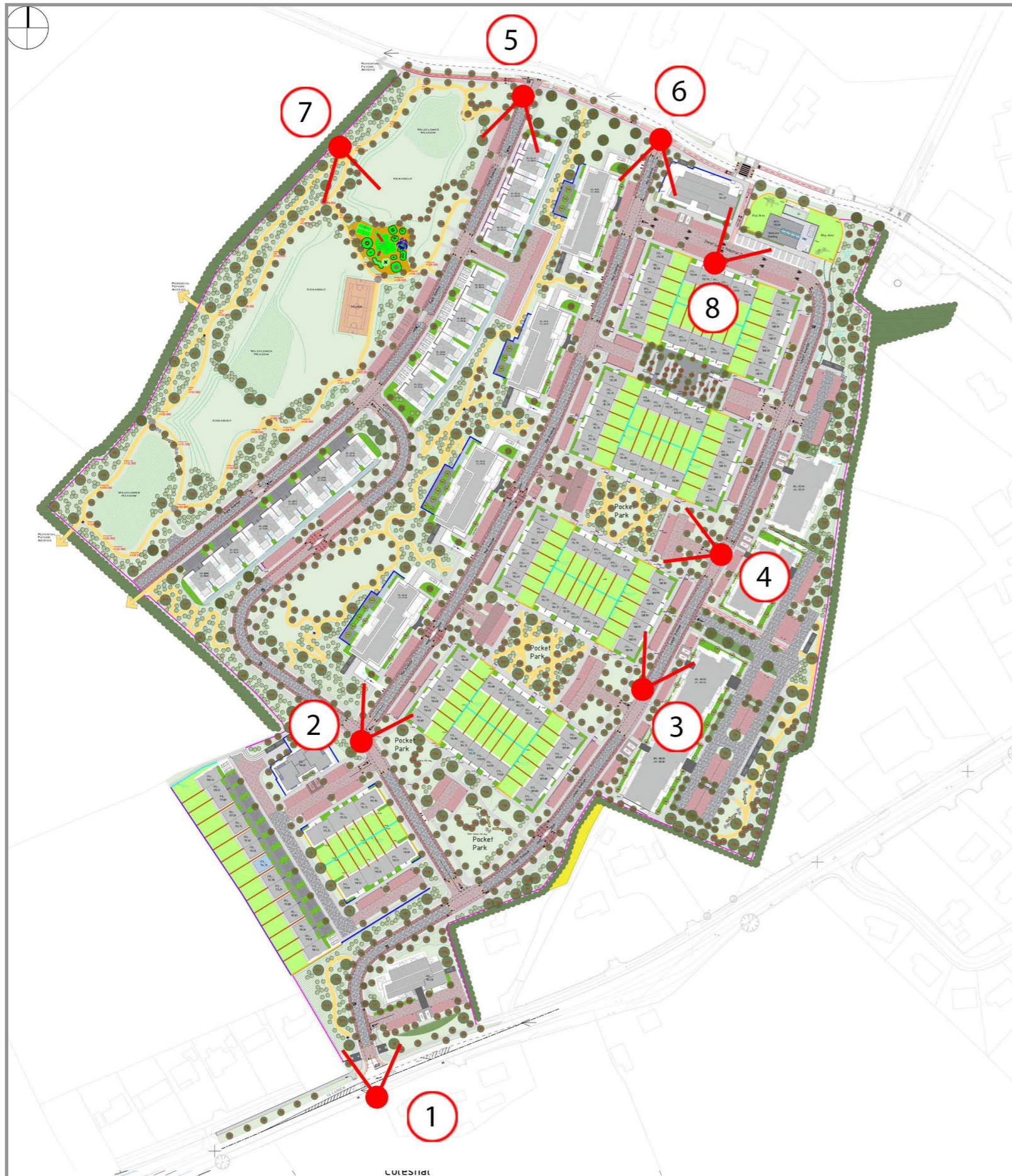
View Location Map - CGI views

This map is for view location purposes only. Please refer to Architects drawings for site layout and redline boundary.